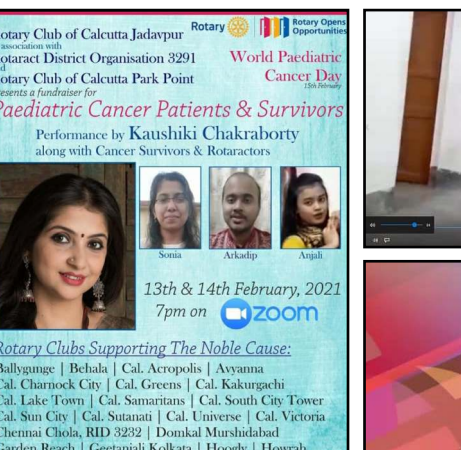
li Kolkata | Hoogly | He Co-Hosted'Paediatric Cancer Programme'