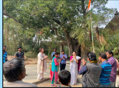
Flag Hoisting on 26th January