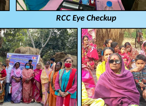
Cataract Operation of 15 people