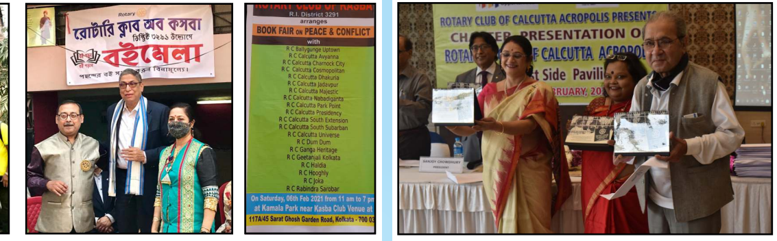
Rotary Book Fair