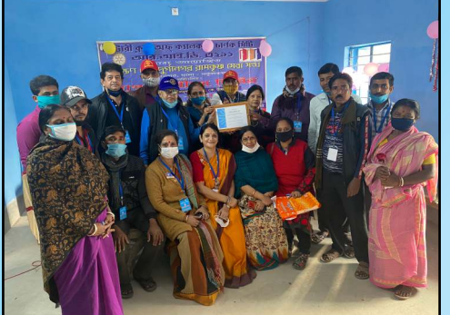
RCC Charter Presentation