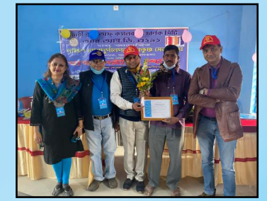
RCC Charter Presentation

Felicitation for Donation of Land to RCC