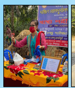
ZS Rina in action